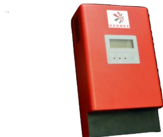
Gennex MPPT Solar Charge Controller